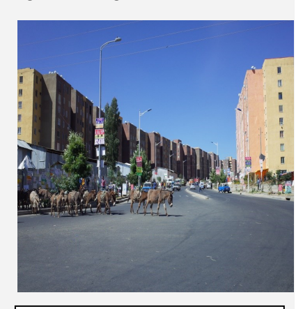
Yeko Abado Addis Ababa

Many struggled with basic things like lack of access to photocopiers etc. to submit CVs for consideration. These findings would all be shared with relevant government authorities and also with those involved in urban planning and housing.