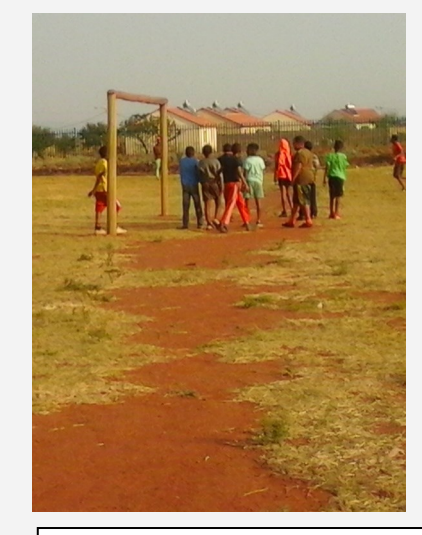
Makeshift sportsground in Lufhereng.