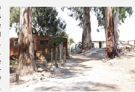
Waterworks informal settlement

Many people have benefitted from gov- and opportunities is needed, as well as ernment investment in services and housing. cheaper and more diverse transport options, Waterworks stands out as an area of limited and support for income-earning activities for investment, different from the other two everyone. Clear improvements in the lives of